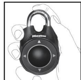
into the lock and squeeze firmly.